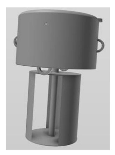
Figure 2 – Model of ocean variant, depicting electrical housing and helical turbine.

The ocean variant consists of two primary components: electrical housing and a helical turbine.