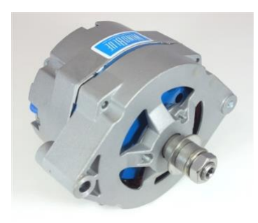
Figure 3 – WindBlue Power DC-540 Permanent Magnet Alternator.

connect its turbine drivetrain to the electrical housing of the ocean variant. The electrical system consists of three primary components: DC alternator, charge controller and a DC-to-AC converter. The electrical system begins with the WindBlue Power DC-540 permanent magnet alternator.